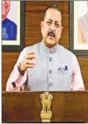
Union Minister Dr Jitendra Singh speaking at a function to mark the 5-year journey of IIM Jammu, on Sunday.

He said today Jammu can boast of having premier institutes in India like