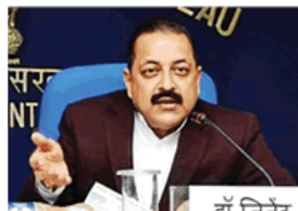
डा. जितेंद्र सिंह

आईआईएम (इंडियन इंस्टीट्यूट आफ मैनेजमेंट) जम्मू की स्थापना के पांच साल पूरे होने पर रविवार को आयोजित वर्चुअल कार्यक्रम को संबोधित करते हुए डा. जितेंद्र सिंह ने कहा कि जम्मू कश्मीर में