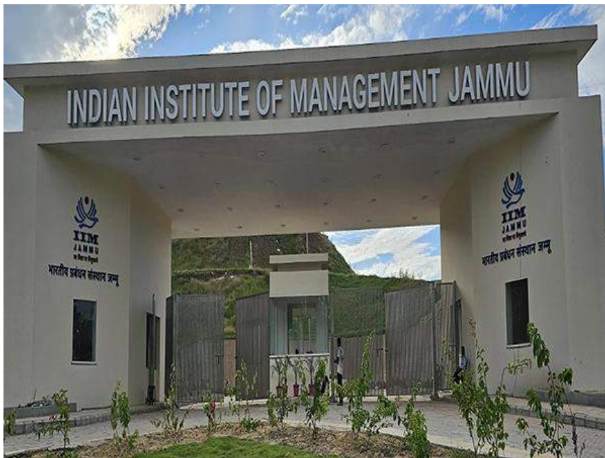
Indian Institute of Management (IIM), Jammu.

J ammu (Jammu and Kashmir) [India], April 4 (ANI): Indian Institute of Management (IIM), Jammu, released its final placement reports for the first batch of the Master's Programme in Hospital Administration and Healthcare